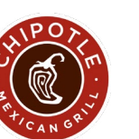
SCOTT BOATWRIGHT CEO, Chipotle

What we serve today helps define the world we live in tomorrow.